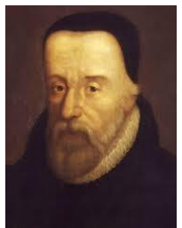
William Tyndale (1494-1536)

"O most holy Christ, draw me, weak as I am, after Thyself, for if Thou dost not draw us we cannot follow Thee. Strengthen my spirit, that it may be willing. If the flesh is weak, let Thy grace precede us; come between and follow, for without Thee we cannot go for Thy sake to a cruel death. Give me a fearless heart, a right faith a firm hope, a perfect love, that for Thy sake I may lay down my life with patience and joy. Amen."