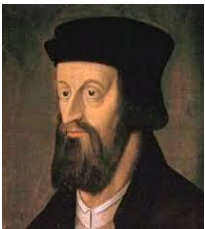
Jan Hus (1369-1415)

"The gospel alone is sufficient to rule the lives of Christians everywhere. Any additional rules made to govern men's conduct added nothing to the perfection already found in the Gospel of Jesus Christ."