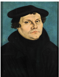
Martin Luther (1483-1546)

"If God spares my life, ere many years I will cause a boy who drives a plough to know more of the scriptures than you do."