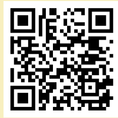
Joy Prom video